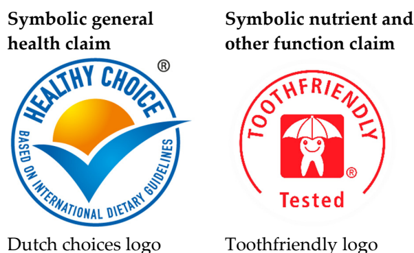
Figure 1. Examples of symbolic claims.

Color-coded nutrition labels (e.g., traffic light or % GDA labeling) did not qualify as a symbolic claim because they present nutritional information but do not suggest a health relationship [28]. All NHC definitions are consistent with EU Regulation: