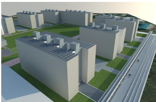
Figure 4: Modelling of PV panels on all rooftops of multi-family housing buildings and on public areas in the complex – parking canopies and pedestrian pathways

The amount of electricity generated using the solar panels for set scenarios is calculated using the PVGIS (Photovoltaic Geographical Information System) and Skelion software, which is used as a plug-in for the Sketch up program. The calculation is conducted for the shadows at winter solstice noon 21.12.2020. (Fig. 4). In Tables 1, the analytic date gain from Skelion simulation for Scenario 1 are given, representing number of installed panels and they total power, and price per different types of buildings in block and in total. Table 2 represents the analytic date gain from PVGIS for Scenario 1 with average monthly electricity production ( E_m ) and average monthly sum of global irradiation per square meter received by the modules of the given system ( H_m ), per months. In Tables 3 and 4 the same type of analytic date using Skelion and PVGIS are presented for Scenario 2.