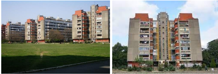
Figure 1: View of the Block 29 residential complex

Milosav Mitić. The contractor for Block 29 was the construction company "Rad" from Belgrade. The structure of the residential part of the block consists of 7 residential buildings, each with 7 above-ground floors, built in the IMS system, with a total of 1129 apartments and a projected population of 4358. Within the block, there is a local community building (today it is also a commercial space) and kindergarten, while the planned primary school was never built [15,19]. The residential buildings in the block are in the form of a two-lane road (Fig. 1,2). Open spaces include the central zone of the park, the zones around residential buildings, and along the perimeter of the block, as well as the basketball court. Road traffic is solved along the perimeter of the block, while the central part of the block is mostly reserved only for pedestrians.