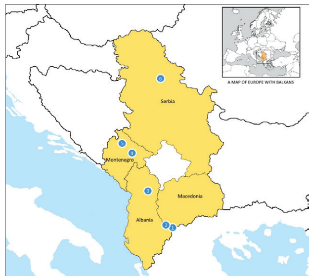
Fig. 1. Map of sampled lakes.

We sampled six lakes in the Western Balkans (Fig. 1): a) Lake Prespa – a transboundary lake situated between Albania, North Macedonia and Greece; surface area: 254 km 2 , max depth 58 m, average depth 14 m (MATZINGER et al. 2006); b) Lake Ohrid – a transboundary lake situated between Albania and North Macedonia; surface area 358 km 2 ; max depth 289 m, average depth 155 m (MATZINGER et al. 2006); c) Lake Lura – Albania; surface area 0.12 km 2 , max depth 20 m, no information exists