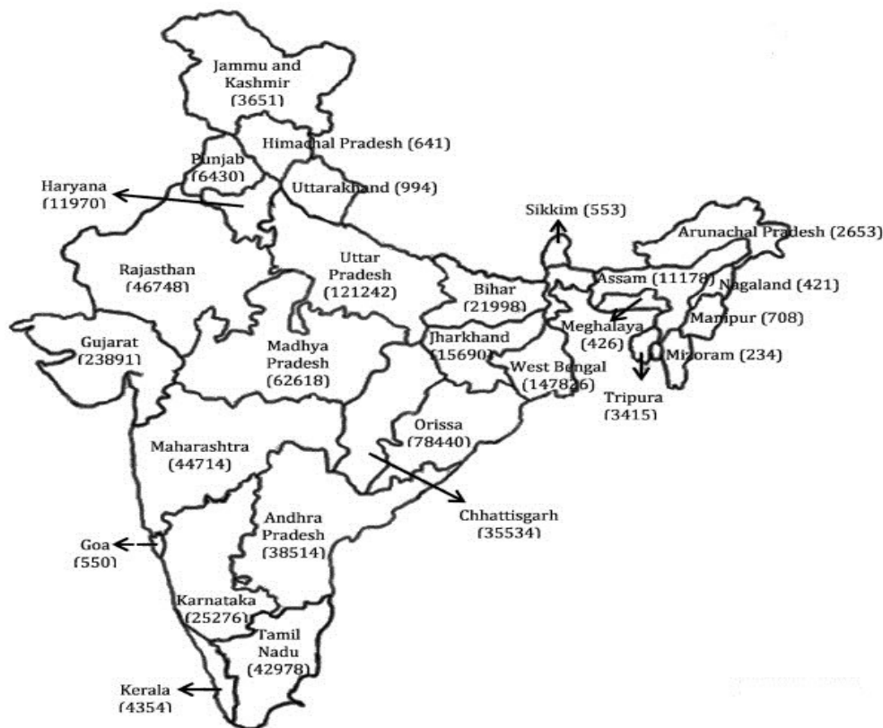
Fig. 2. State-wise wetlands in India (Source: SAC, 2011; Bassi et al. , 2014).

Fish production: Wetland ecosystem is highly supportive to the fish production. The maximum fishes (about 66%) are collected from the level I type of wetland (Inland water bodies), i.e. canals, rivers, ponds, water reservoirs and natural lakes. Fish production has continuously increased in India; total production increased by 9.04 million tonnes from 2012 to the 2013 year and about 12.59 million tonnes between the years 2017 to 2018 (Table 5). The State of Andhra Pradesh had the topmost position of the fish production with the 27% of total production followed by West Bengal, Gujarat, Orissa, Tamil Nadu and Uttar Pradesh respec-