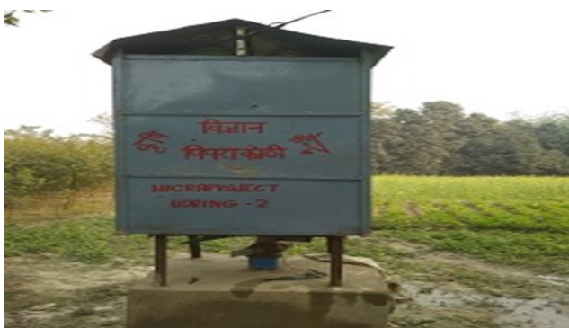
Fig. 1. Tube well with pumping Shed unit.