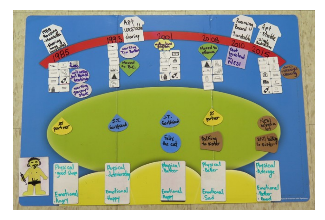
Figure 1: The Vidaview Life Story Board™ populated with simulated data

Figure 2 shows the magnets chosen for use in this study, including both magnet labels provided in the LSB kit and additional labels developed by the community researchers. As can be seen, these include both visual and verbal elements. Further training was provided to the community researchers regarding research ethics and qualitative interviewing methodology. They were trained in both the role of interviewer , who was primarily responsible for asking interview questions, and storyboarder , who created the visual representation to illustrate the story with the guidance of each participant. The board was primarily used to gather and organize participants' information and to facilitate the process of the research interview. Although digital photographs were taken of the board at several intervals during each interview, the visual information from the LSB is not analyzed here.