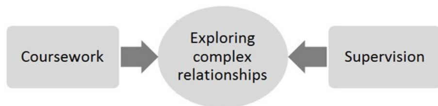
Figure 2: Doctoral education delivery [26]

We are experienced international higher education academics. Coming from the United States and Australia, and working with doctoral students for over 25 years between us, we were able to draw upon the delivery of doctoral research classes; QDAS master class training in numerous locations internationally; and ongoing doctoral supervision.