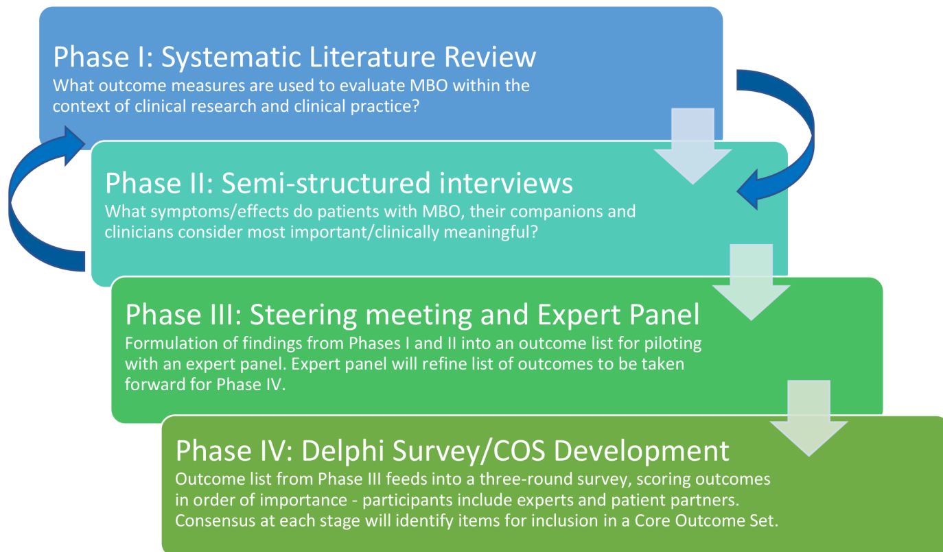
Figure 1 Process for the development of a core outcome set (COS) for malignant bowel obstruction (MBO).

represent lay stakeholders in the study management group advising on recruitment and participant-facing documentation. They will also contribute to thematic analysis of the interview data. Lay representatives will also be involved in the interpretation and dissemination of the study results.