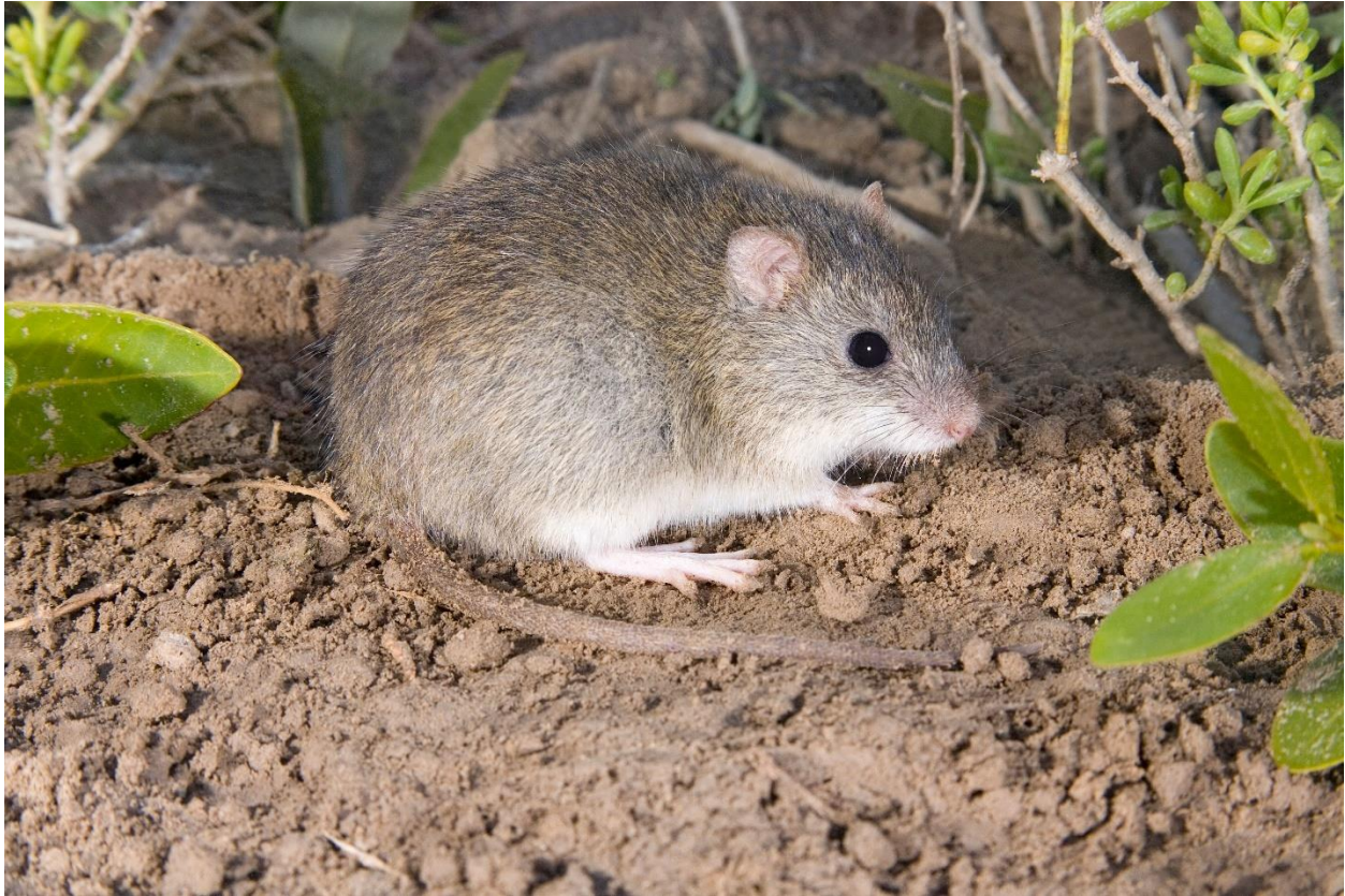
Figure 1. Adult rice rat showing typical coloration and long tail.

types of vegetation on the grid as well as the foods available for the small mammals living in these habitats.