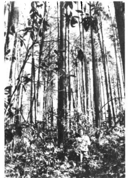
Figure 1. The Camp site.

TWO CEDAR STANDS THAT differed in age, size, and location were selected for study. Site 1, called the Camp Site, was a 7-hectare patch of cedars surrounded by maple-gum forest and located in Virginia. It survived the most recent logging operation and is best described as being an overmature (= past prime-timber growth) stand with an encroaching hardwood midstory and a dense evergreen shrub understory (Fig. 1). This island of century-old trees is surrounded by