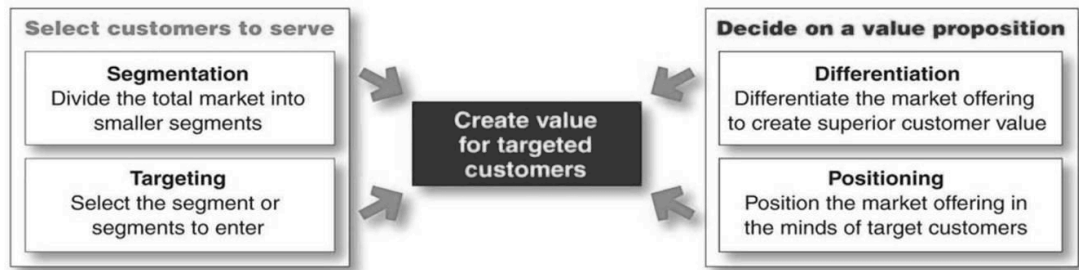
Figure 2. Designing a Customer-Driven Marketing Strategy (Kotler, Armstrong 2012, p. 215)

occupy a clear, distinctive and desirable place relative to competing products in the minds of target customers. (Kotler, Armstrong 2012, p. 214)