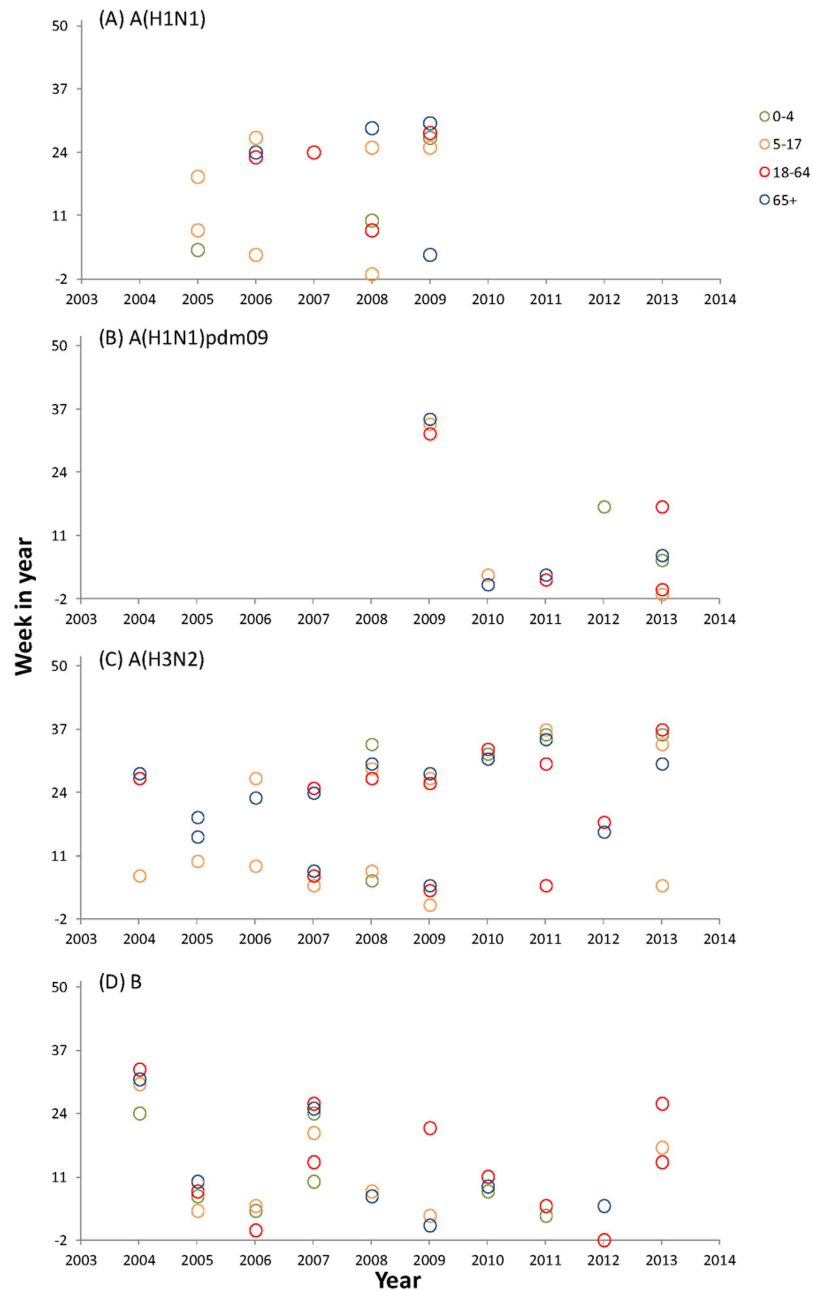
Figure 3. Onset time of influenza epidemics of (A) A(H1N1), (B) A(H1N1)pdm09, (C) A(H3N2) and (D) B, in cool or warm season of each year by age groups, 2004–2013. Week number ranges from -2 to 50, with negative indicating the weeks before that corresponding year (i.e. -2 represents week 50 of last year). Warm season is defined as week 19 to week 50, and cool season as week 51 to week 18 of next year. Threshold for epidemic is set at 4% of annual total age-virus-specific positive cases.

reliably reflect the true variation of influenza cases within each age-virus group. Second, our data were obtained from people who sought for medical treatment in two hospitals, thereby likely representing relatively more severe cases. Therefore our results may not reflect the relative timing of virus activity across different age groups in community outbreaks. To better understand the age pattern of all infected cases, ideally a random sample of people with influenza-like symptoms should be drawn from the community, but such a study can be hindered by enormous demands on financial cost and manpower. Nevertheless, age pattern of infected cases that required medical treatment still provides valuable information on age profile of different respiratory viruses and can thus facilitate the formulation of control measures specifically targeting on different age groups.