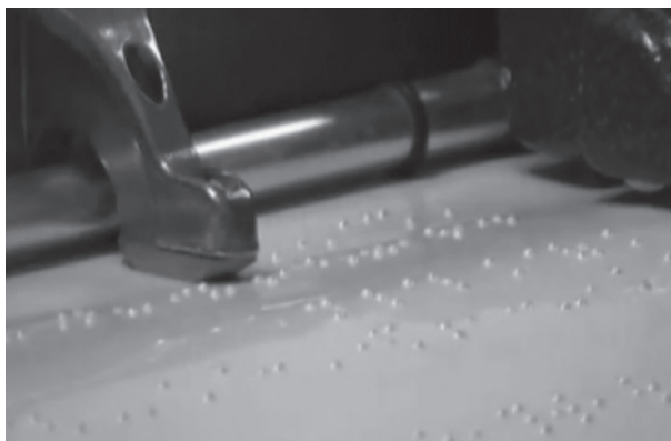
Fig. 2: The transposition of printed words into Braille.

friends, Shen experimented with the idea of transposing printed texts into the Braille code, thus enacting an intersemiotic transcreation from the verbal to the tactile (Figure 2).