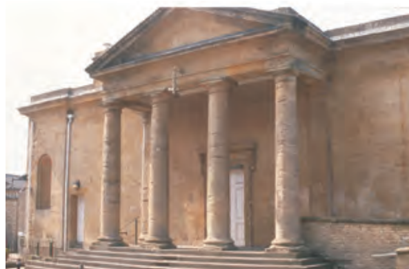
Figure 13. Chipping Norton Town Hall, Oxfordshire (G.S. Repton 1842)

To develop and sustain such a large number of new towns and cities required a plethora of essential services. New schools were particularly important, as were hospitals, almshouses, social centres, shops, museums, prisons etc. Perhaps of greater importance than some of the other services was the provision of a suitable drinking water supply. The industrial conurbations of the Pennine area were particularly well served by the construction of numerous reservoirs high in the Pennine hills. Invariably many of these structures were stone built or at the very least stone faced. An expanding city like Bradford needed to construct dozens of such reservoirs. Most were built by opening up small quarries in the Carboniferous sandstones near the reservoir site and although few developed into quarries of national importance they were major local employers for some considerable time and construction work continued into the early part of the twentieth century. (Bowtell 1979). On a much larger scale the Vyrnwy Dam (1881-1892) supplying water to Liverpool, the Elan dams (1893 to 1904 Ordovician Caban Coch conglomerate and Carboniferous Pennant