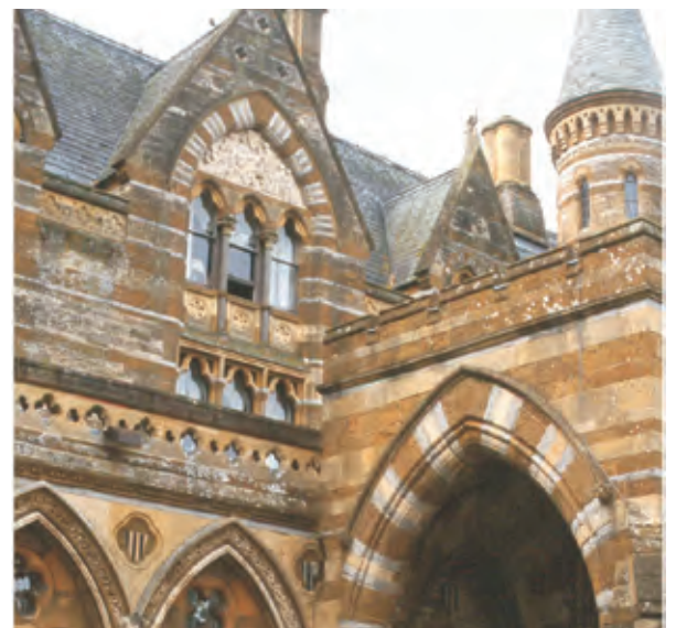
Figure 16. Ettington Park, Warwickshire – Lias limestone, Horn-ton and Cotswold stones (John Pritchard & J.P. Seddon 1858–62)

The success of the establishment of the architectural profession at this time cannot be underestimated as the style, ingenuity and sheer colourful flourish of the buildings they produced has never been matched before or since (Fig. 16). The pace of industrial progress was gathering speed and the need for innovative designs for an unprecedented number of new buildings, e.g. railway stations, town halls, mills, factories and docksides, not to mention the requirement