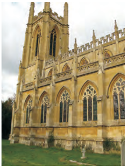
Figure 12. St Peter, Hampton Lucy, Warwickshire (T. Rickman & Hutchison 1822-6)

completed its task and further work, largely sponsored by private funds, resulted during the period 1840–76, in all a total of 1727 new churches being built and 7144 existing churches being restored (Clarke 1939). In Shropshire for example 84 new churches were constructed between 1830 and 1869. The restoration of churches proved to be a lucrative area of work for both the architects and the stone industry. There are very few of our churches that escaped the attentions of these Victorian restorations. The best known of them is probably George Gilbert Scott who was perhaps responsible for the ‘revising’ of more of our medieval churches than most across the country. His often criticized efforts in this field were largely responsible for the eventual creation of the Society for the Protection of Ancient Buildings by William Morris and others in 1877, established to prevent such misuse occurring again. However, Scott was not alone in his work, in the East Midlands, for example, the Hine practice in Nottingham ‘restored’ more than 21 local churches. Church building was not of course restricted to the Church of England and many Roman Catholic churches were also constructed at this time, e.g., St Edward, Clifford (Magnesian Limestone, Permian). Pugin constructed several gothic churches and also the RC cathedral at Nottingham, the latter using Derbyshire Stancliffe Darley Dale sandstone.