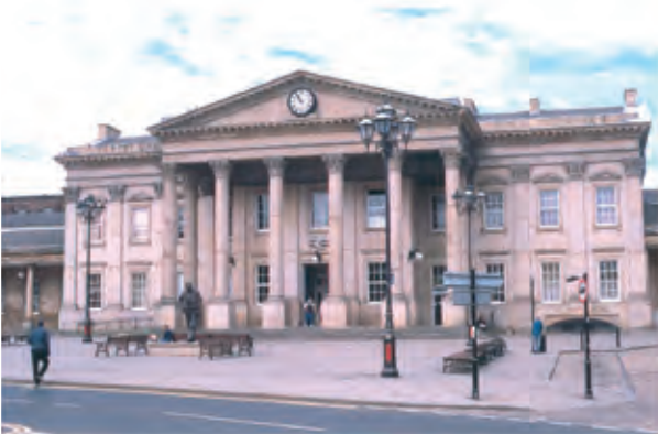
Figure 5. Huddersfield Station, W. Yorkshire (J. P. Pritchett 1847–48)