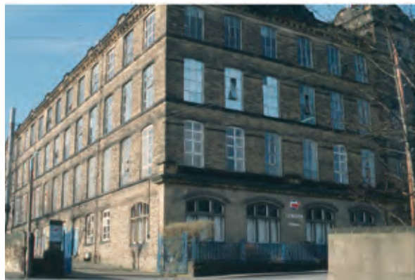
Figure 9. Cleckheaton Mill