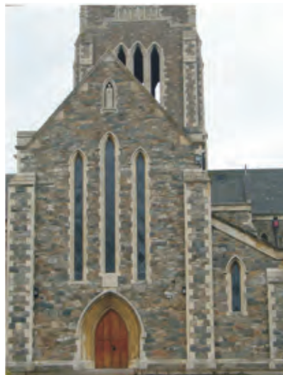
Figure 14. Mount St Bernard Abbey, Leicestershire (A.W. Pugin 1843

It is clear, however, that some architects were very concerned about the choice of materials for their buildings and the stone selected became very much a part of the design.