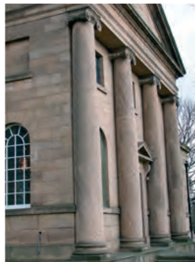
Figure 1. St Peter & St Leonard Church, West Horbury (Carboniferous Woolley Edge sandstone – John Carr 1791-3)

charge of the construction and probably even use stone from their own quarries to ensure quality and continuity of supply. The Smith family of Warwick dominated building in the Midlands, often using the local Triassic, Bromsgrove Sandstone; the Carr family in West Yorkshire used Carboniferous sandstones and