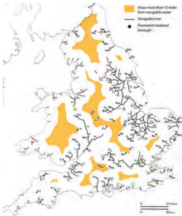
Figure 2. Medieval navigable river systems, watersheds and principal stone quarrying areas. (T, Tadcaster; H, Huddleston; D, Doncaster; A, Ancaster; B, Barnack; T, Taynton; D, Doulting; G, Grinshill; C, Caen Stone buildings).

However, it is also clear that there was still little if any organisation of production and distribution on a national level, and most of the stone produced was principally for use in the local area. The few quarries able to distribute stone nationally, were those fortuitously sited on the coast, or near navigable rivers, a situation that had not changed substantially since medieval times (Fig. 2).