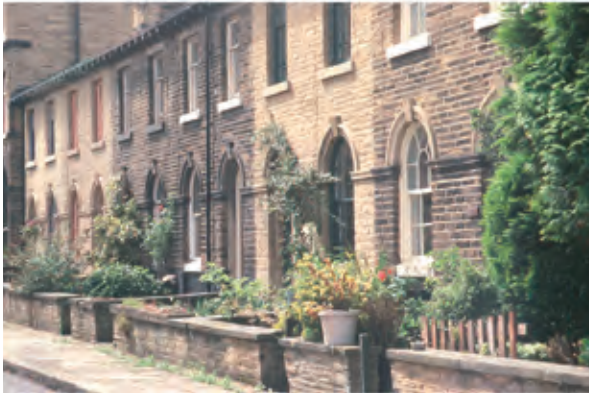
Figure 10. Saltire housing (Lockwood & Mawson 1851–56)