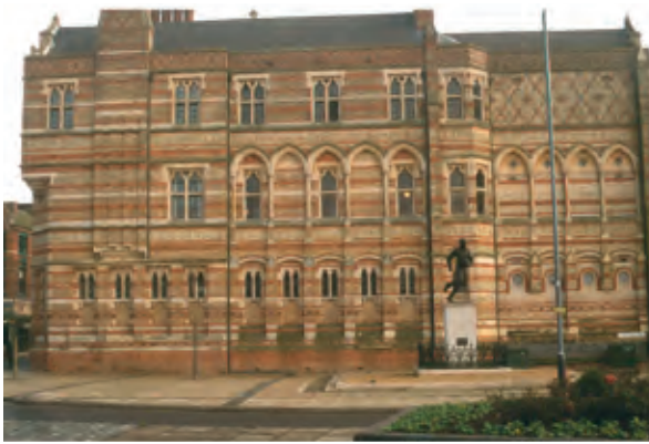
Figure 7. Rugby School, Warwickshire (W. Butterfield 1867 and later)

lished, in 1856, a comprehensive lists showing the price of their Corsham, Box Ground, Corngrit and Combe Down limestones delivered by rail to any part of England or Wales (Hudson 1971, Appendix 2). They certainly appear to have reaped the benefits as Bath stones were commonly selected as dressings for many Victorian ‘villas’ and other buildings in towns far away from the mining area, for example in Oxford or at William Butterfield’s Rugby School where Box Ground Stone was also used (Fig. 7).