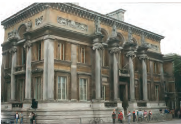
Figure 6. Ashmolean Museum, Oxford – Portland and Box Ground stones (C.R. Cockerell 1841–45)

Paley used Runcorn Stone in the new All Saints Church in Hertford.