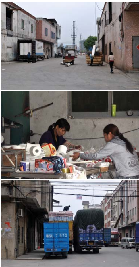
FIGURE 6A, 6B, 6C: The distributed factory of toilet roll production.

In contrast to this rapid industrialization, one plot amidst the frenzied construction is devoid of activity, containing a series of empty and incomplete three-story brick houses, interspersed with patches of vegetable crops and wasteland. Its current sta-