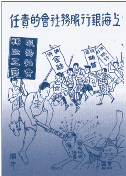
Figure 2: SCSB poster

Source: Shanghai Municipal Archives (comp.), Chen Guangfu rijì (Diary of Chen Guangfu) (Shanghai: Shanghai shudian chubanshe, 2002), p. 187.