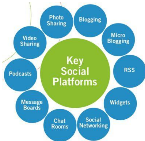
FIGURE 1. Key social platforms (Universal McCann 2008, date of retrieval 18.10.2011)