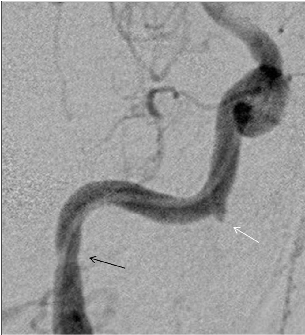
After angioplasty with stenting of the stenotic segment and PED placement 119x130mm (150 x 150 DPI)

1 2 3 4 5 6 7 8 9 10 11 12 13 14 15 16 17 18 19 20 21 22 23 24 25 26 27 28 29 30 31 32 33 34 35 36 37 38 39 40 41 42 43 44 45 46 47 48 49 50 51 52 53 54 55 56 57 58 59 60