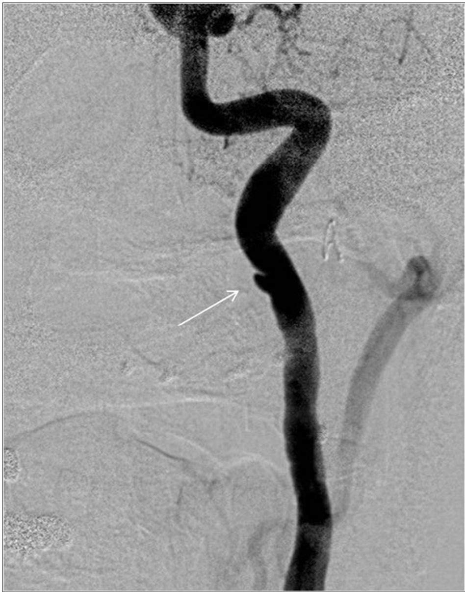
Patient 6. DSA shows a pseudoaneurysm at the right petrous ICA;

1 2 3 4 5 6 7 8 9 10 11 12 13 14 15 16 17 18 19 20 21 22 23 24 25 26 27 28 29 30 31 32 33 34 35 36 37 38 39 40 41 42 43 44 45 46 47 48 49 50 51 52 53 54 55 56 57 58 59 60