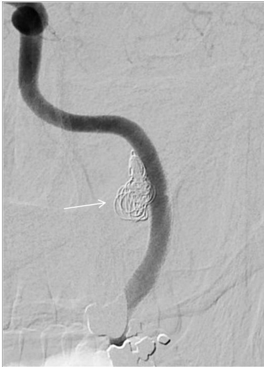
Follow-up DSA at 8-month shows the obliteration of the pseudoaneurysm and a patent parent artery. 87x120mm (150 x 150 DPI)

1 2 3 4 5 6 7 8 9 10 11 12 13 14 15 16 17 18 19 20 21 22 23 24 25 26 27 28 29 30 31 32 33 34 35 36 37 38 39 40 41 42 43 44 45 46 47 48 49 50 51 52 53 54 55 56 57 58 59 60