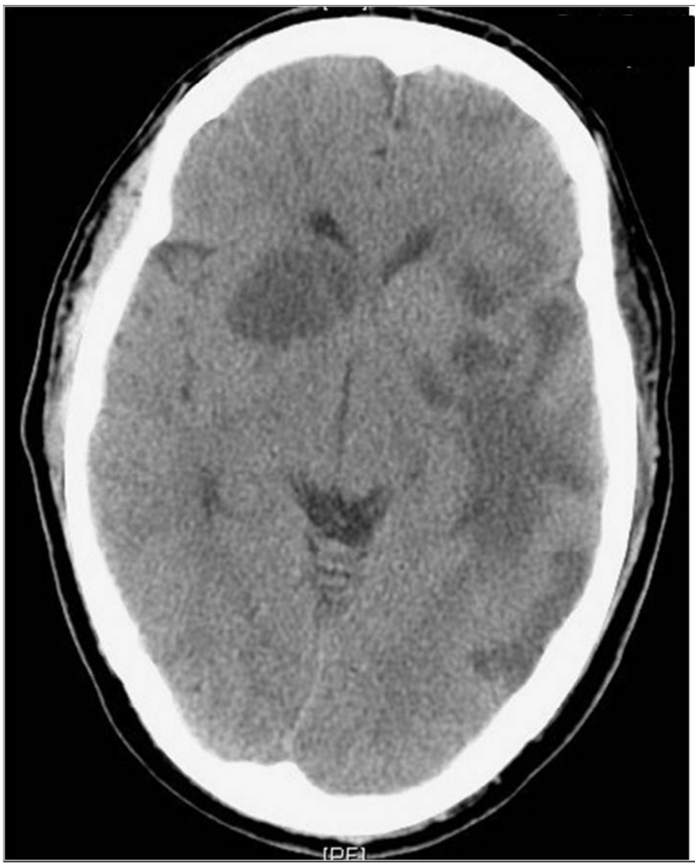
CT brain at day 1 post-operation shows multiple ischemic infarctions. 121x149mm (150 x 150 DPI)

1 2 3 4 5 6 7 8 9 10 11 12 13 14 15 16 17 18 19 20 21 22 23 24 25 26 27 28 29 30 31 32 33 34 35 36 37 38 39 40 41 42 43 44 45 46 47 48 49 50 51 52 53 54 55 56 57 58 59 60