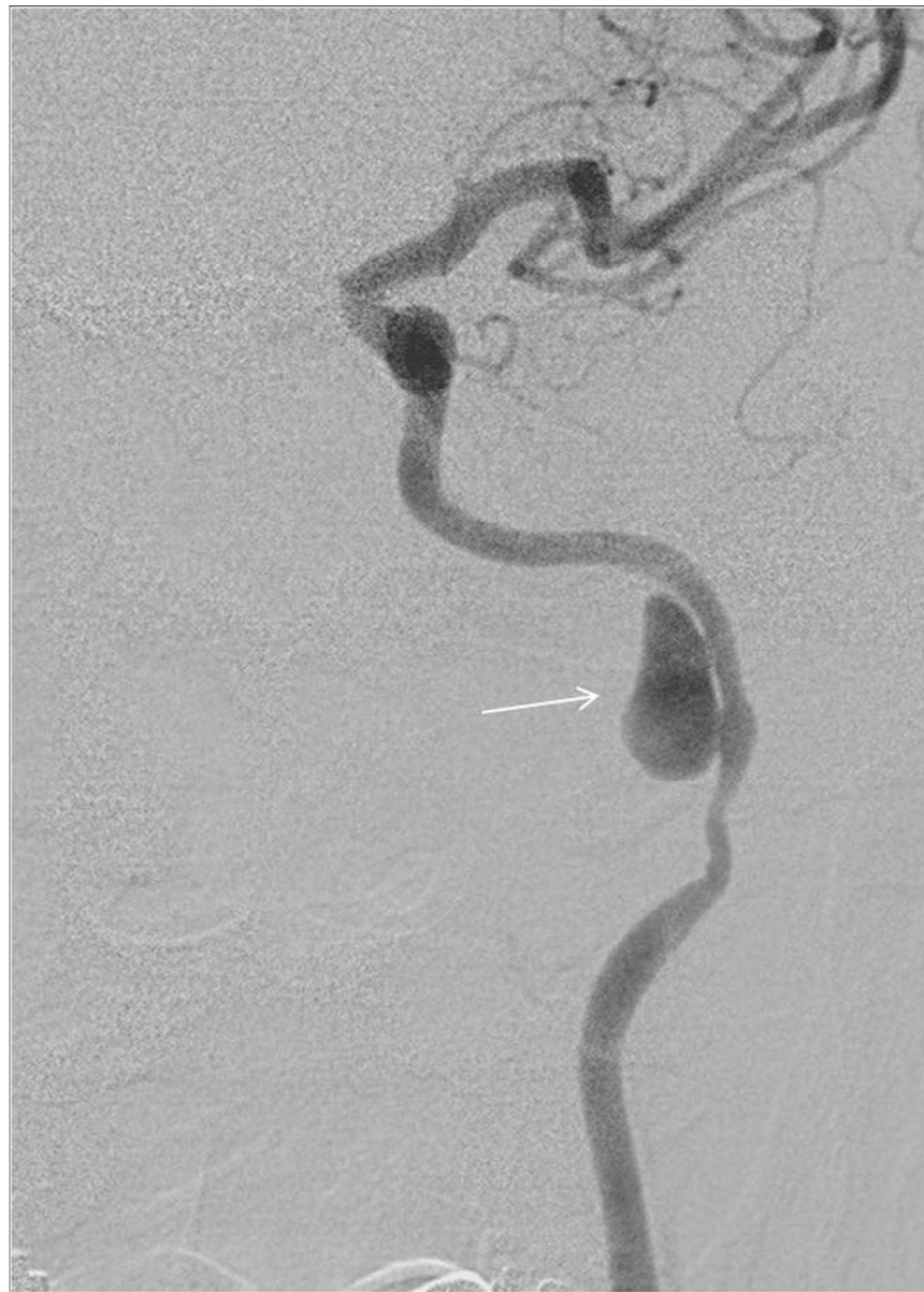
Patient 5 treated with the PED with adjuvant coiling. Diagnostic DSA shows an 8 x 14mm left petrous ICA pseudoaneurysm;

1 2 3 4 5 6 7 8 9 10 11 12 13 14 15 16 17 18 19 20 21 22 23 24 25 26 27 28 29 30 31 32 33 34 35 36 37 38 39 40 41 42 43 44 45 46 47 48 49 50 51 52 53 54 55 56 57 58 59 60