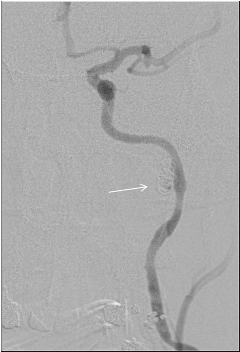
Obliteration of the pseudoaneurysm sac after placement of 2 PEDs and coil 85x125mm (150 x 150 DPI)

1 2 3 4 5 6 7 8 9 10 11 12 13 14 15 16 17 18 19 20 21 22 23 24 25 26 27 28 29 30 31 32 33 34 35 36 37 38 39 40 41 42 43 44 45 46 47 48 49 50 51 52 53 54 55 56 57 58 59 60