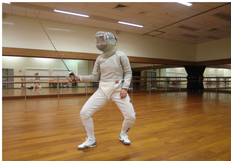
Figure 1a: On guard pose.

could cause the asymmetry in the limb muscles. As the anthropometrical and somatotype data were observed consistently in the studied fencers over time, their asymmetrical limb characteristics were evidently influenced by their practice.