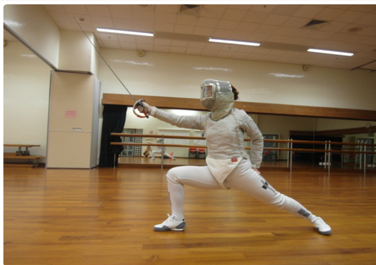
Figure 1b: A lunge.

The relationship between performance and physiological characteristics varies with different styles of fencing. Adrian and Klinger [19] observed that fencers were capable to attack the opponent from a deep on-guard posture point. Their studies showed that fencers' lunge speed (Figure 1b) was inversely related to the vertical impulse generated by the rear leg. They also found a directly proportional relationship between the lunge speed and the horizontal impulse of the rear leg. The drive from the rear leg could be the main factor in promoting the speed and power of the lunge for an attack [20]. The power generated by fencers has also been found to be independent of their level of skill. Some skilled male fencers may present monotonic energy while less skilled ones present maximum energy [21]. Skilled fencers seem to require less power but are faster at hitting the target, suggesting a relationship between coordination and technique.