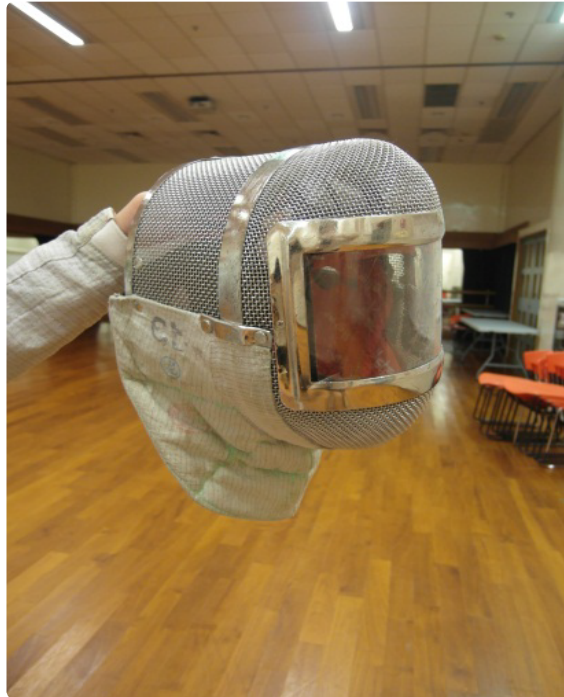
Figure 2f: A sabre mask.