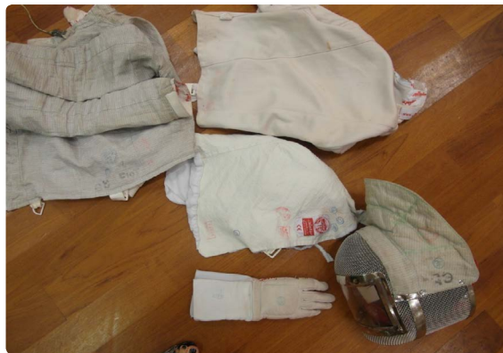
Figure 3: Stamps on approved equipment and protective clothing before the commencement of competitions.

According to Zemper et al. [39], around 50% of fencing injuries could be preventable. The contributing factors include inadequate warm-up, dangerous tactics, poor defending skills, overtraining and the overuse of repetitive movements. Recommendations for injury prevention in fencing sports can be found on the British Fencing website [50].