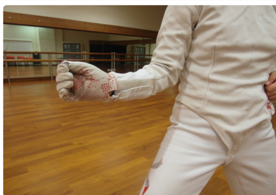
Figure 2e: Glove.

Reports of heat illness and heat exhaustion induced by the fencer's protective mask, gloves and plastrons (Figures e-f) are common [33]. The risk of heat illness greatly increases when the fencer begins in a dehydrated state. When dehydration reaches a state commensurate to a 3% decrease in body weight, the gastric emptying rate slows and epigastric cramps and nausea increase [34]. Maximal exercise performance is not impaired if dehydration is as short as 60 seconds; however, physiological functioning and optimal competitive ability is significantly impaired when dehydration lasts for more than a minute. Heat cramps occur during or after intense exercise in the group of exercised muscles due to an imbalance in the hydration level and electrolyte concentrations. With heat exposure, the electrolytes are not replenished in time and this increases the muscle spasm. Therefore, it is essential to intake plenty of water containing salt and to increase the daily salt intake in the few days before a competition.