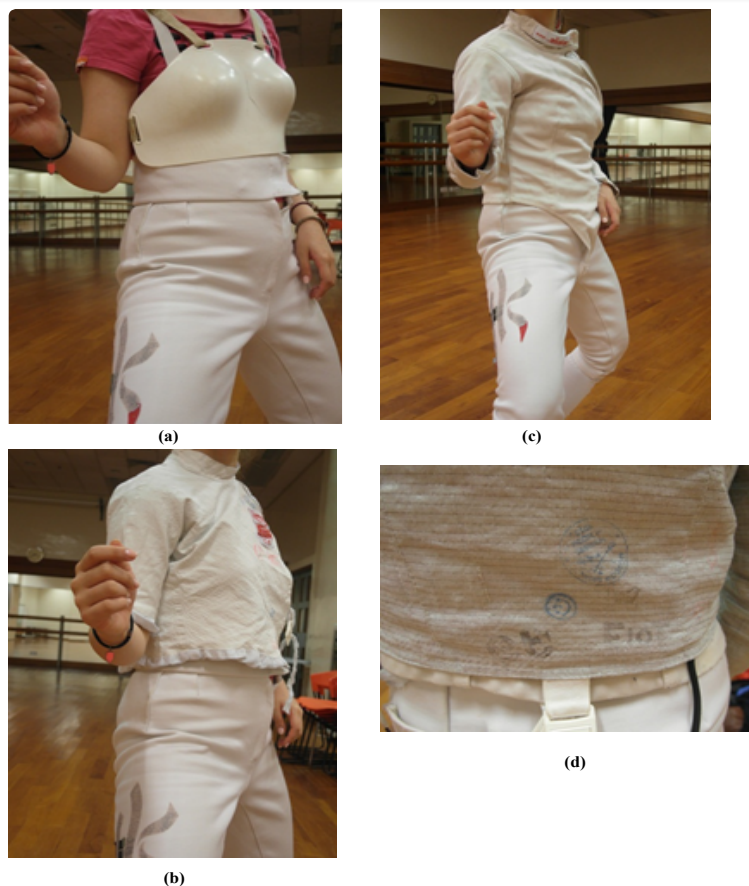
Figure 2(a-d): Four layers of clothing protection (inner protector, under plastron, outer plastron and the electric protector for foil and sabre).

and gloves for body protection (Figures 2a-d), which may increase water loss. Heat stress is high during fencing training and competitions as perspiration enhances the loss of water-soluble vitamins, namely B1, B2 and B3 [32]. During heat stress, there are two hormonal adjustment mechanisms for preventing salt and fluid loss through sweating. First, the pituitary gland releases an antidiuretic hormone, which increases water reabsorption from the kidney tubules during hot conditions. Second, the adrenal cortex releases aldosterone to increase the renal tubules' reabsorption of sodium and thus decrease the sodium concentration in the sweat. These two hormonal adjustments facilitate additional electrolyte conservation in thermoregulation [24].