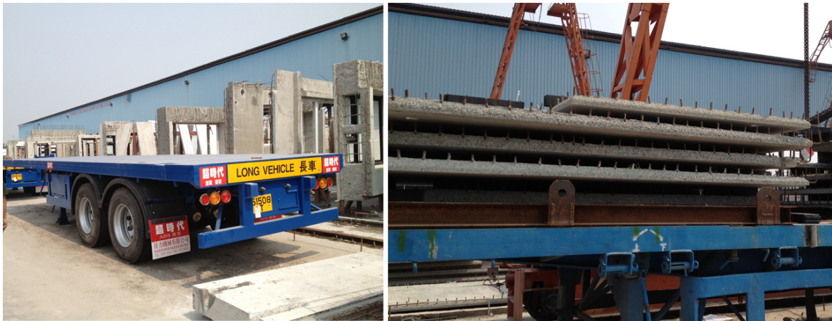
Fig. 6 Transportation of building components in prefabrication construction

Transportation of prefabricated building components to Hong Kong is often outsourced to professional logistics companies. According to the interview, the prefabricated components are mostly transported to Hong Kong by lorries (see Fig. 6). The logistics companies are responsible for loading, fastening, and unloading of the prefabricated building components, as well as custom clearance. Instead of transporting the components to the construction sites using a Just-In-Time (JIT) system, the logistics companies place them in their warehouses in Lok Ma Chau, which is a large spare area just very close to the Hong Kong-Shenzhen border. We call this a semi-JIT system, whereby the prefabricated components can be buffered in warehouses to guarantee a stable supply to the sites in view of the different holiday arrangements between Hong Kong and Shenzhen, and the narrow and congested streets in Hong Kong. This does, however, entail double-handling.