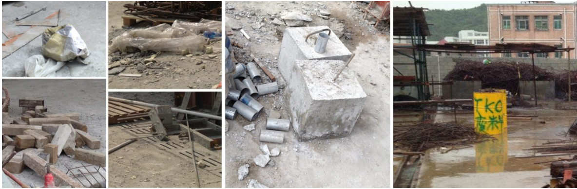
Fig. 4 Construction waste generated from the manufacturing process of prefabrication construction

Finding enough space for temporarily storing the large amount of prefabricated components is often challenging (see Fig. 5). For example, one of the companies is trying to set up a company in another satellite city in the PRDR mainly because the current site is almost full. The storage process needs to be handled with great care. Otherwise it will cause significant construction waste as the concrete has hardened and all the materials have been fabricated together. Unlike construction sites which are often of confined areas, a prefabrication yard is often even, flat and spacious for handling and storing building components. As a result, the wastage level in this process can be reduced to nearly zero. Quality inspection by the client is conducted regularly at this stage to proactively prevent counterfeit components and construction waste.