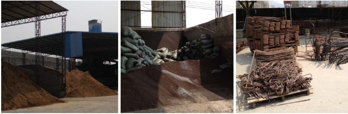
Fig. 2 Pre-treatment and storage of construction materials in a prefabrication yard