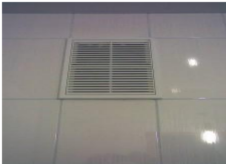
Figure 6. Exhaust air device in Russia.