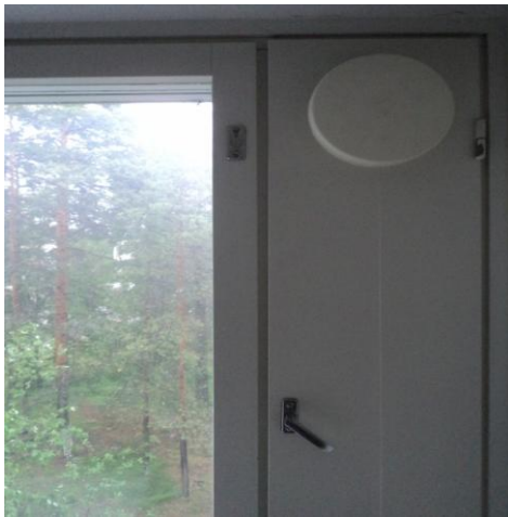
Figure 2. Inlet valves in windows .