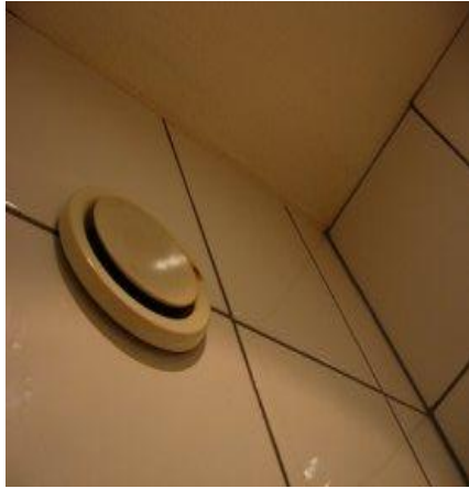
Figure 5. Exhaust air device in Finland.