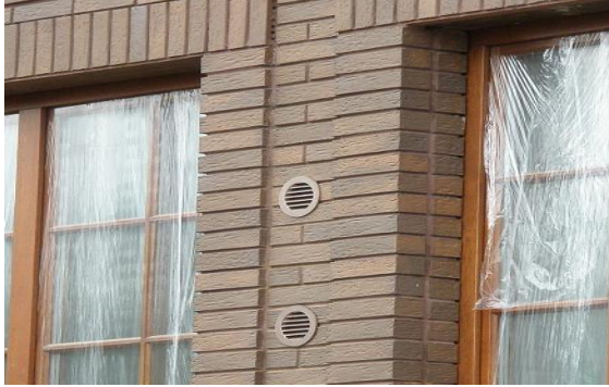
Figure 1. Inlet valves in walls .

The requirements are approximately the same. In Finland the air comes to the premises from outdoor through a special device. Devices that are common for Finland are presented in figure 1, 2 and 3.