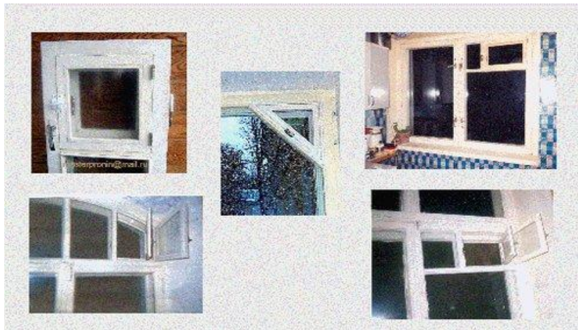
Figure 4. Windows leaves.

In Russian buildings the air usually comes to the premises from outdoor through the cracks in windows or through the window leaves. It is presented in figure 4.