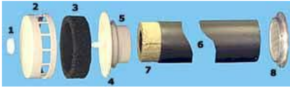
Figure 3. The construction of inlet valve .

1 – adjustment device; 2 – cover tip; 3 – filter; 4 – the interior of the tip with the flap; 5 – O – Ring; 6 – plastic pipe; 7 – heat and noise insulation; 8 – aluminum grille with mesh