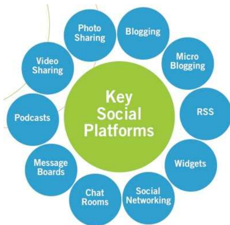
Figure 3; key social media platforms (source; virtual project consulting 2010)

Social Media Optimization is in many ways connected as a technique to viral marketing where word of mouth is created not through friends or family but through the use of networking in social bookmarking, video and photo sharing websites. In a similar way the engagement with blogs achieves the same by sharing content through the use of RSS in the blogosphere and special blog search engines to understand this work the figure below shows how various key social platforms are linked