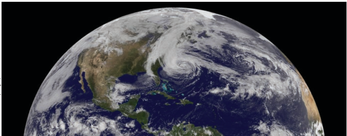
NASA image of Hurricane Sandy acquired on October 28, 2012

The 'sudden' switching on of hot seawater in the southeastern part of the North Atlantic