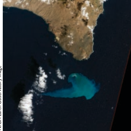
NASA image of the El Hierro submarine eruption acquired on January 4, 2012

The North Atlantic Oscillation (NAO) is a climatic phenomenon in the North Atlantic Ocean caused by changes in atmospheric pressure at sea level between the Icelandic low and the Azores high. Two extreme phases exist, positive NAO and negative NAO, when the pressure contrast between the two regions increases and decreases respectively. This exerts control on the strength and direction of westerly winds and storm tracks across the North Atlantic, but is variable without any periodicity. The Atlantic Multi-decadal Oscillation on the other hand is a mode of natural variability in sea surface temperatures of the North Atlantic Ocean with a period of between 60 to 80 years. Because sub-aerial volcanic eruptions and submarine volcanic eruptions are responsible for temperature, pressure and humidity changes, they may be important as triggers for weather-related events or patterns within the North Atlantic Basin. This account is a look-back-and-learn