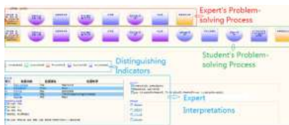
Figure 2. Reflection on problem solving process.

After submitting the diagnostic conclusion, the student can review and reflect on his/her diagnostic process captured by the system in a diagram. The diagnostic diagram includes initial information of the patient, performed examination in a sequence, and clinical judgment after each examination. Once the student's diagnostic process reaches some degree of similarity with that of the expert, the diagnostic diagram of the expert for the same case can be viewed by the student. The differences in the problem solving process between the student and the expert are also highlighted by the learning environment. Further, expert interpretations are provided to help the student to reflect on his reasoning process and underlying knowledge that supports the reasoning process (see Figure 2).