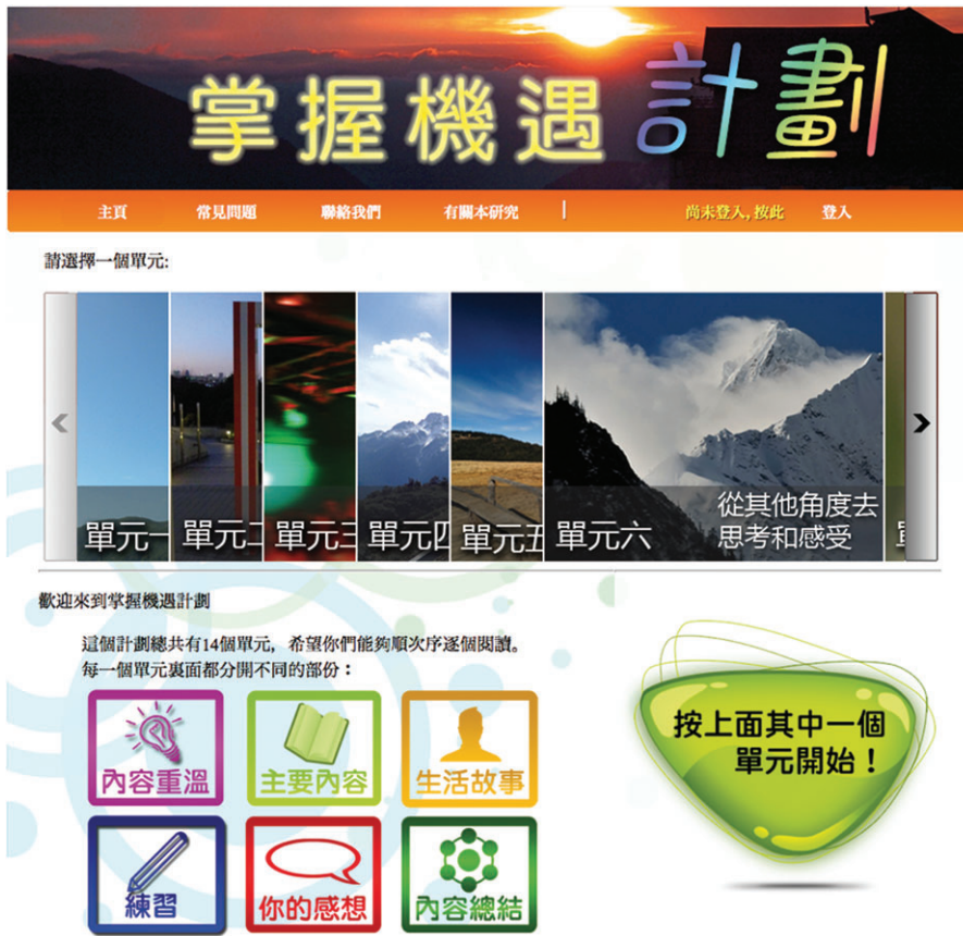
Figure 2 Screenshot from the new “Grasp the Opportunity” website for the Hong Kong adaptation.

Despite some success with diverse populations, using this intervention in foreign countries presents a new challenge. As a result of the transitions under British and Chinese rule, Hong Kong has both Eastern and Western cultural elements. Consequently, Hong Kong is an ideal country to investigate the cultural adaptation of a Western psychiatry intervention for a Chinese audience. Recently, models describing the process of cultural adaptation of interventions have been developed (17, 18). These models were originally developed for HIV/AIDS interventions in international settings, and emphasize collaboration with community partners. In regards to these models, the current state of the adaptation is outlined in Table 1.