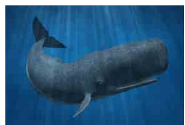
Ambergris, secreted by whales, has been used in perfume for centuries

WASHINGTON – Leading US medical associations have urged fewer tests for patients with mild health conditions and less aggressive treatment for advanced cancers in a bid to cut costs. They say that patients with advanced tumours who showed no benefit from prior treatments should not be given chemotherapy; hi-tech scans for patients with early prostate or breast cancer that appears at low risk of spreading should be avoided; patients’ exposure to radiation should be minimised; ECGs of patients with low risk for heart disease are of no benefit, as are CT and MRI scans for people with low back pain, or for those with fainting symptoms in the absence of signs of seizure or other neurological symptoms; colonoscopies could be done less often in patients who show no signs of disease; and doctors should not prescribe antibiotics for sinus infections unless they last more than seven days. The recommendations are detailed at http://choosingwisely.org . AFP