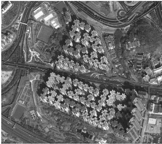
Figure 5. Mei Fu Shan Chuen Development

A Self-contained Township planned in 1969 for 46,245 residents or 13,068 households, this enormous development has 117 towers of 15 stories tall apartment buildings (Figure 5). This self sufficient city has shops on the ground floor and residential use on the floors above. With food markets, cinema, salon, etc., it is also connected to the public transport system (bus Terminal and MTR Station).