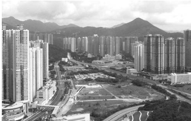
Figure 6. Tseung Kwan O New Town