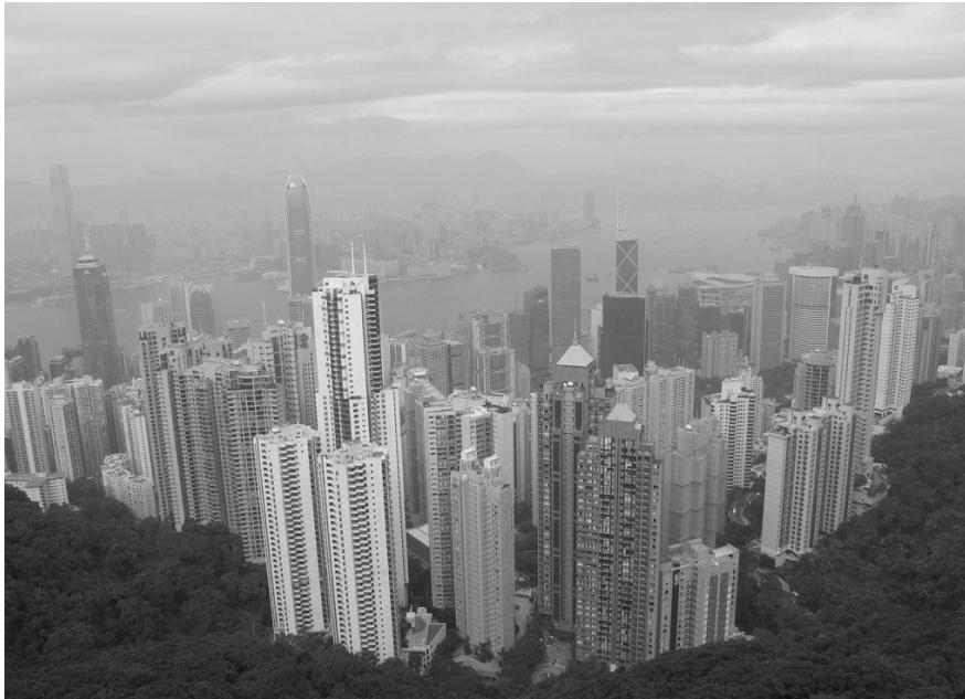
Figure 8. Bird view of Hong Kong

China is going through one of the most dramatic social and cultural transformations in its history. In this speed change scenario, the never –questioned conventions in architecture have been misunderstood, betrayed. Invention, reinterpretation sometimes even revolution, never represent a step further as they did in the European XXI century theoretical thinking.