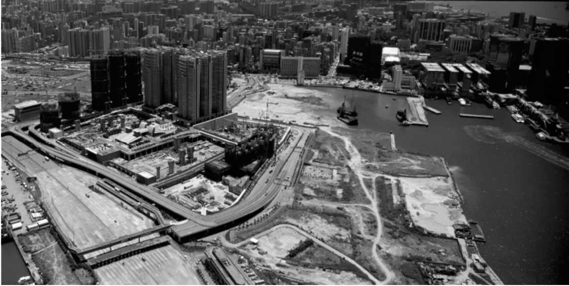
Figure 7. Multiple Use Development at Kowloon Station Site