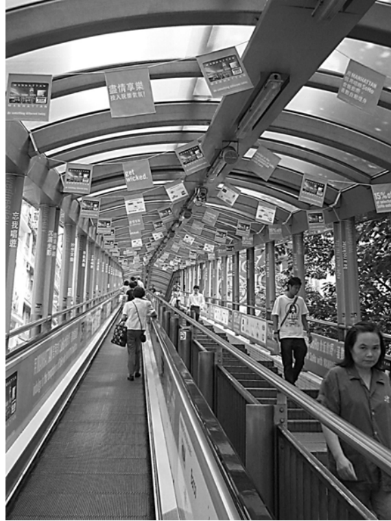
Figure 3. Central–Mid-levels escalators

Highly efficient transport systems including Ferry, MTR, KCR, LRT (in new towns), Bus, Min Bus, Tram and Taxi services are supporting a densely living style in Hong Kong. Other transportation tools such as mechanical staircase systems are also facilitating the access from the most active districts to the higher living area in the island.