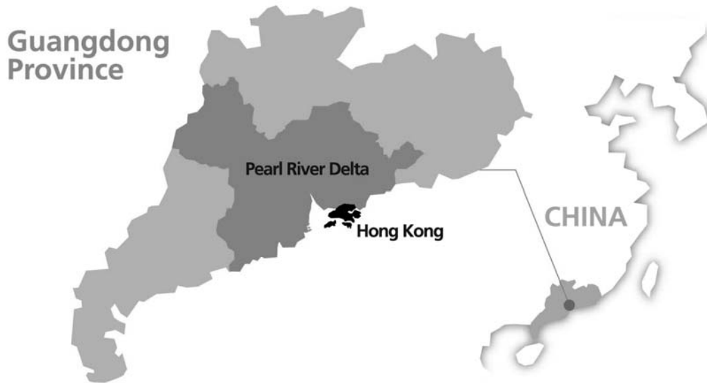
Figure 1. Geographical location of Hong Kong