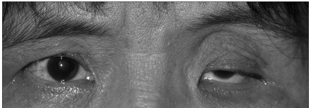
FIG 1. Left eye enophthalmos and pseudoptosis