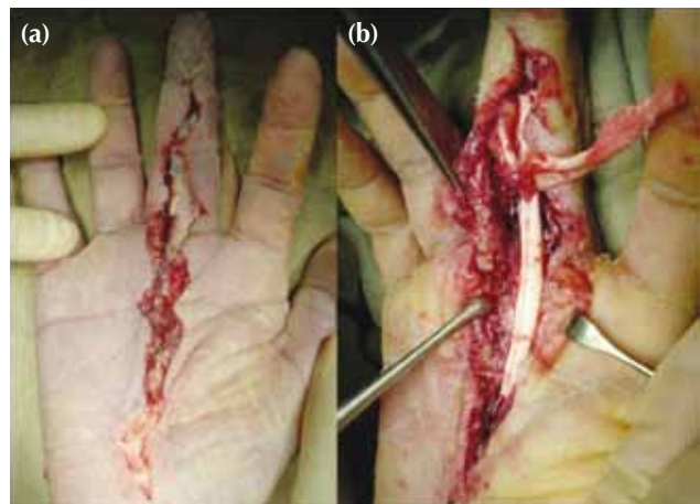
Figure 3 A 68-year-old diabetic fishmonger with a puncture injury at the right middle finger: (a) refractory infection despite 5 debridement procedures, (b) exposed bone, dessicated flexor tendons and friable skin edge. She ultimately underwent a ray amputation to control the infection.

unsatisfactory outcome were more likely to have received intralesional steroid injections (43% [16/37] vs. 10% [12/118], p<0.001 , Pearson Chi squared test), have presented >2 months after injury (27% [21/79]