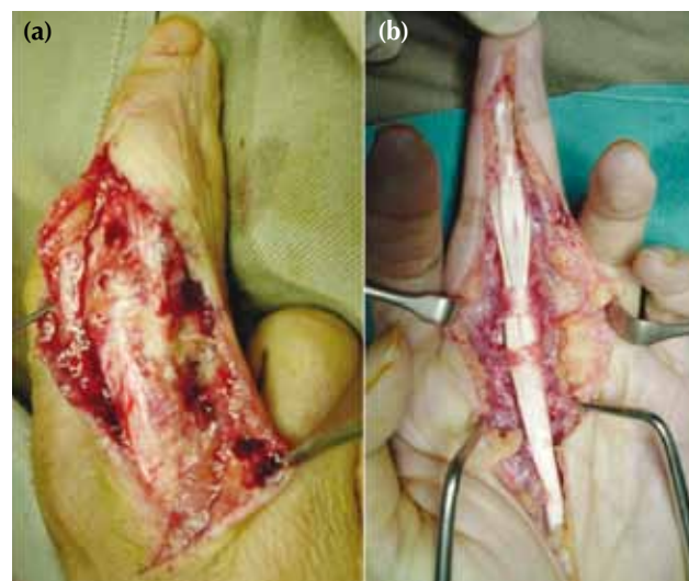
Figure 1 (a) Extensor synovectomy and (b) flexor tenosynovectomy

Of 166 patients, 84 were fishermen or fishmongers and 26 were seafood handlers (at home or work). 131 (79%) of the patients had marine exposure during injury, 84 of whom injured the flexor side (79 involved the fingers). 92 (55%) of the patients had finger injuries, 69 of which involved the flexor side. 74 (45%) of the patients injured the hand and wrist; 34 of whom involved the flexor side. Thus, 63 (38%)