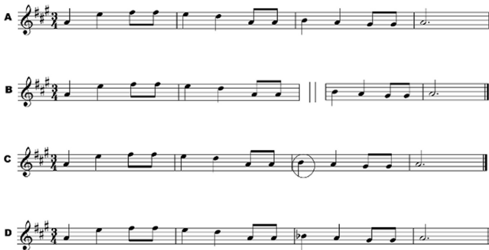
Figure 1. Example of a melody in the On-Line Identification Test of Congenital Amusia. Conditions for the melody are shown: no incongruity (A), time incongruity (B: || refers to the silence of 5/7 of the beat duration), mistuned pitch incongruity (C: the circled note refers to the mistuned pitch), and out-of-key pitch incongruity (D). doi:10.1371/journal.pone.0033424.g001