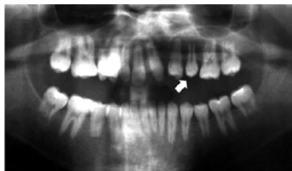
Figure 6: Microdontic maxillary left second premolar.

of missing teeth (37.5%) was higher than the 4.5% for Danish and Norwegian children [14], the 5.2% for Swedish subjects [17], and 10.1% for Finnish children [68]. The prevalence of hypodontia in the non-cleft region of UCLP children was 33.3% which is in the range of 28% to 48.8% reported by Böhn [14], Hellquist et al. [17], and Ranta [68]. Similarly, the prevalence (41%) of hypodontia in BCLP was within the 17.9% to 68.4% range quoted by Böhn [14] and Ranta [68]. When children with CP alone are considered, the finding from this study (32.1%) is similar to that of Böhn [14], but much higher than the 22.7% reported by Olin [8].