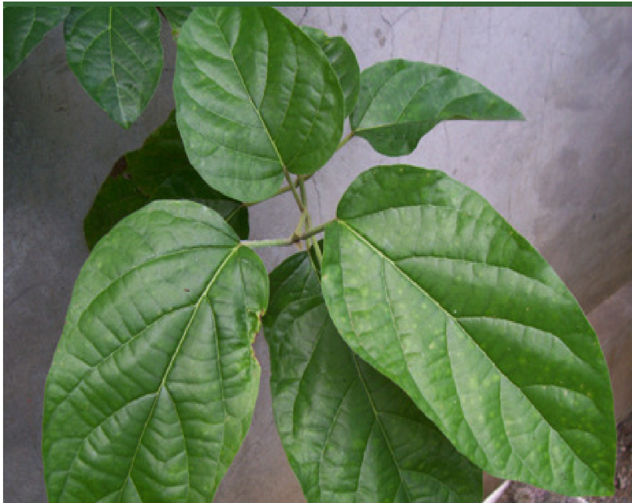
Figure 1. Leaves of P. odorata .

(solvent B). The gradient elution was as follows: 20% B for 0 to 10 min, 20 to 40% B for 10 to 20 min, 40 to 60% B for 20 to 30 min, 60 to 80% B for 30 to 40 min, 80 to 95% B. The post-running time was 10 min. Flow-rate was set at 1.0 mL/min. The UV-Vis detector was set at 254 nm. The column was maintained at room temperature.