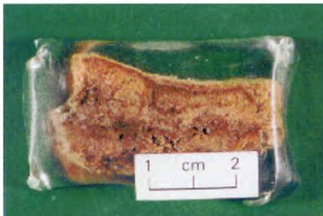
Figure 3. Curved beddings caused by hand palm press (handprint).