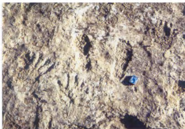
Figure 1. A group of handprints and footprints on spring travertine layer.

In order to date the formation period of the prints, the origin of the prints must be investigated. Two possible causes may bring about the formation of the prints: art carving and human hand and foot press when travertine was soft. A damaged handprint has been found and the lower part of the palm press still remains. The thin-section across lower part of palm of the print has been made and the layering structure can be clearly seen (Figure 3). It is