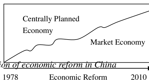
Figure 1: An illustration of economic reform in China

Intertwined with the political and economic development is its unprecedented urbanization in China. Urbanization has been the major drivers of China's GDP growth over the past decades and it will become even more so over the next 20 years. According to the UN World Urbanization Prospects (UN, 2009), the level of urbanization in China is 46.1, with a population of 620million living in urban areas, while this level will be 73.2 in 2050 and the urban population will be 1 billion. A McKinsey report (2009) forecasted that 1 billion people