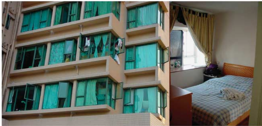
Figure 6: Frequently used curtain on bedroom windows for privacy (left: from outside; right: from inside).

it is justified to reduce the window size in a privacy-sensitive situation in order to avoid invasions of privacy.