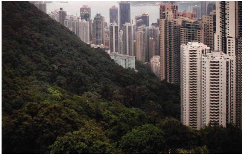
Figure 1: The compact residential environment on the limited buildable land in Hong Kong.

The urban character of Hong Kong favors vertical expansion of the city, resulting in a compact urban environment where living, working and leisure happen in a mixed and combined mode. The urban form takes the shape of urban canyons where living spaces at the lower portion of skyscraper apartment buildings are often deprived of daylight, natural ventilation and views. Therefore, window design is usually assumed to be a challenging issue. To tackle this problem, authorities of the Hong Kong government have adopted a series of design regulations based on daylighting performance in residential window design.