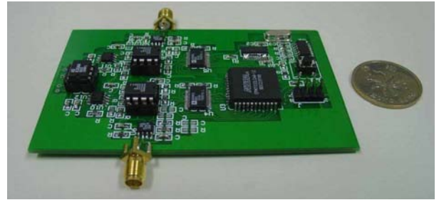
Fig. 2 MRI two channel FDM PCB prototype

Results: A prototype of the two channel FDM PCB board is shown in Fig. 2. The two channel standard 64MHz sinusoidal signals are input to the board and the expected two different frequencies (200kHz and 400kHz) mixed signals are obtained as output to verify the FDM function. A high frequency, high Q bandpass filter is difficult to design and construct. However, after we down converted the signal frequency, the design is relatively easier. Finally, we can get the mixed signal with SNR above 95% of that obtained using the traditional method.