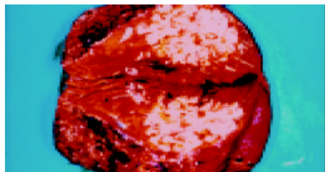
Figure 2 Yellowish firming well-circumscribed mass in the right hepatectomy specimen.

The patient was treated initially with intravenous cefotaxime and metronidazole, and the fever subsided after 1 wk of antibiotics treatment. However, due to the large size of the lesion and the worry about possible malignancy, surgical exploration was decided. Intraoperatively, in addition to the liver mass, a 10 cm soft tissue tumor was found in the ileum at 15 cm from the ileocecal valve. The tumor and a segment of the small bowel were resected and frozen section examination showed a spindle cell tumor. Trucut biopsy of the liver mass and frozen section suggested a metastatic spindle cell tumor. In view of an isolated hepatic metastasis without lymph node involvement or other evidence of metastasis, an extended right hepatectomy with a 1 cm resection margin from the tumor was performed (Figure 2).