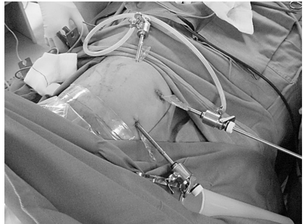
FIG. 2. Metallic trocars anchored during a laparoscopic nephrectomy in a 9-month-old girl.