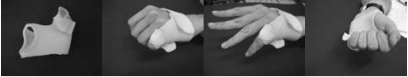
Figure 2 Active mobilisation of the hand with the thermoplastic metacarpophalangeal block splint.

remained after stabilisation; (2) improper splintage—modified splintage to achieve proper angulation for fracture alignment; (3) improper rehabilitation—re-education of the patient regarding treatment and physiotherapy; and (4) unacceptable reduction—fracture re-reduction under radiographic control and additional double splintage, if required.