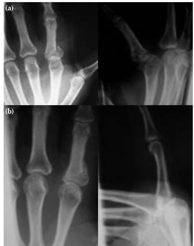
Figure 3 (a) Preoperative radiographs showing a comminuted proximal phalangeal fracture of the ring finger. (b) Postoperative 7-week radiographs showing bone union after dynamic treatment.

Functional and radiological assessments were made at each follow-up, and included ROM of