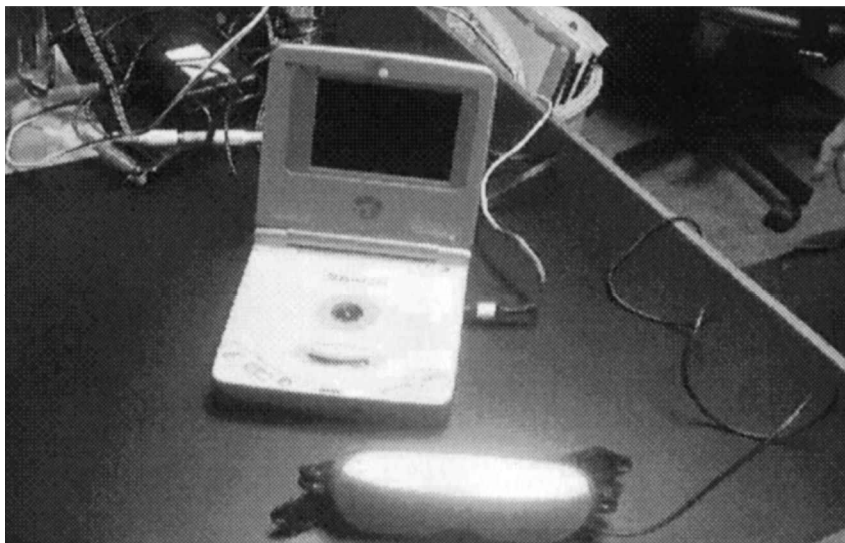
FIG. 1. The Olympic Eyetreck eyeglass was connected to a VCD.

The study was a randomized, controlled, cross-over study. Subjects were randomly assigned to participate in either a V-session or a B-session first. In a V-session, subjects were instructed to wear the eyeglass with the visual content of a soundless video display of a natural environment such as mountains and a waterfall. In a B-session, subjects watched a static blank screen via the eyeglass. The study was conducted over 2 separate days. Subjects allocated to V-sessions on the first day would be allocated to B-sessions on the second day, and vice versa. Subjects were instructed to concentrate on watching the display. Subjects were asked about their anxiety level before tourniquet inflation in a V-session with numerical anchors ranging from 0 to 10, where 0 was no anxiety and 10 was the highest anxiety. 21 Furthermore, the extent of simulation sickness and the degree of getting into the video world were ascertained after a V-session. Subjects were