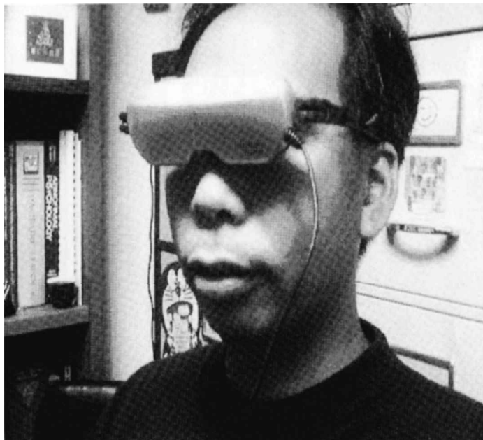
FIG. 2. Subject wearing the eyeglass display.

asked to rate the extent of feeling nausea to measure the extent of simulation sickness with numerical anchors ranging from 0 to 10, where 0 was none and 10 was very much. 22 Likewise, subjects were asked the extent to which they felt immersed into the simulation world. A numerical anchor ranging from 0 to 10 was used, where 0 was "I did not feel like I went into the video world" and 10 was "I went completely into the video world." 21