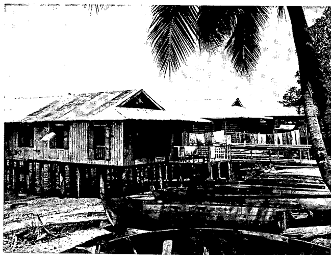
Fig 2 Though traditional Malay settlements on the Southern Islands appear to be economically oriented to the sea, the houses are generally not those of fishermen but of urban workers and the boats are used to commute to the mainland

Malaysia to take up temporary employment. Furthermore, amongst indigenous Malays, families tend to be rather larger than amongst other communities.