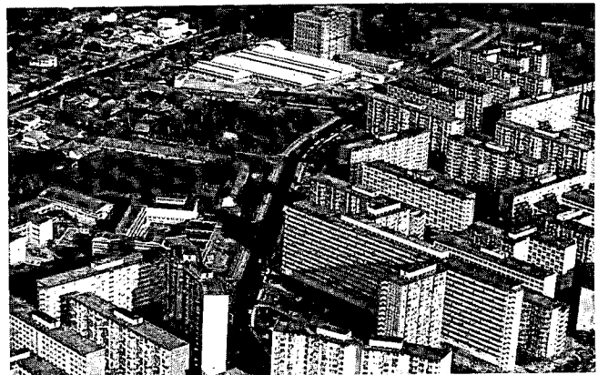
Fig 6 Housing Development Board apartments with adjacent light industry, Redhill

While Singapore was a member state of Malaysia development was slow but with independence in 1965, development, based upon both imported and local capital, proceeded apace. Industries are of many types and range from the heaviest types of oil refining, chemical manufacturing, ship breaking, ship building and ship repair, iron and steel manufacture, based on scrap, to light industries such as making of gramophone records and printing. These industries have been based upon an abundant and skilled labour-force. Labour resided away from Jurong at first. This problem has been partly solved by the building of a dormitory town though something of commuter problem, common to other industrial areas as well as Jurong, still exists. Such has been the success of the Jurong venture, that the government Corporation responsible now is responsible for a number of other estates where land is being prepared for industrial purposes. The Corporation