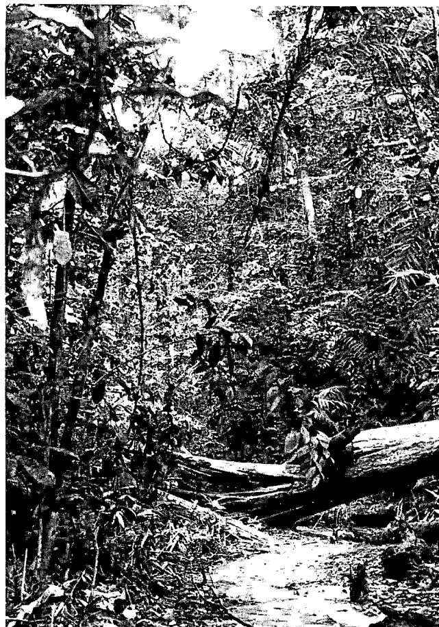
Fig 1 Jungle Fall Stream, Bukit Timah Nature Reserve, Singapore, a tiny remnant of the original landscape

Singapore is often taken as the archetype of the humid equatorial climate. In general, however, means tend to mask a considerable degree of variability from day to day and from season to season. The mean daily maximum temperature ranges lie between 30.5 and 32.2° C, whilst