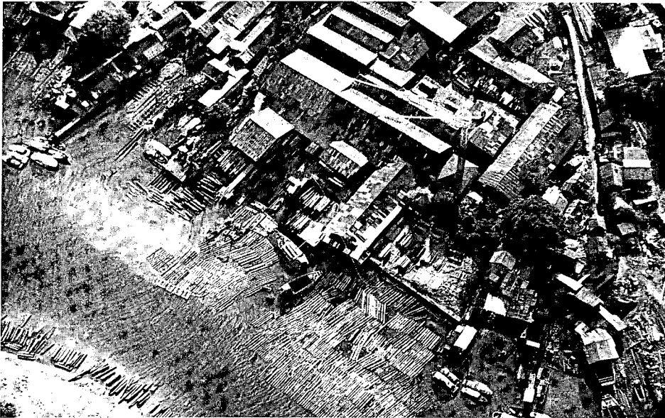
Fig 7 Water-oriented industry. Milling of hardwoods imported from the adjoining region. Kallang Basin