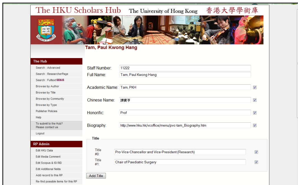
Figure 5. Example of Edit Page for RP Owner