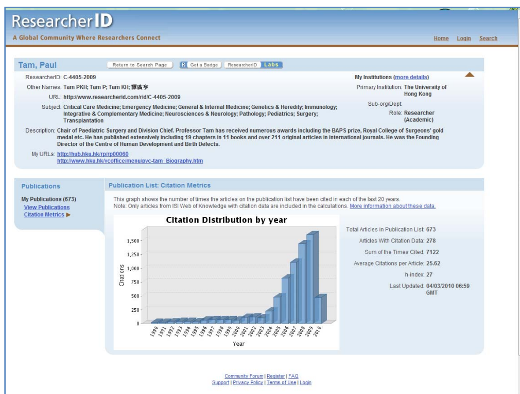
Figure 2. Example of ResearcherID (April 2010)

ResearcherID. We could not find similar procedures to correct data in Web of Knowledge. We then happily learned of Thomson Reuters ResearcherID [10]. Although researchers themselves could create these accounts for themselves, they rarely do. We therefore used XML files to create in batch mode, ResearcherID accounts for each of the approximate 1,500 HKU professional staff. We used publication data from the HKU ROS, placed into XML, and uploaded to these accounts. We then gave the unique ResearcherID and password to each individual researcher, who can now personally edit this information. If the data matched upon entries in WoK, citation metrics from WoK will accrue in real-time to the entry in ResearcherID, and cumulate to its author. Using ResearcherID, we generated an “R” badge and HTML code to place on each scholar’s ResearcherPage. MouseOver on this badge will show the author’s top three cited articles. ResearcherID is public, needing no paid subscription to view.