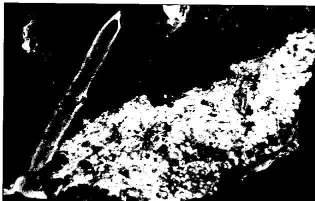
Fig 1. Cut surface of the liver showing focal fatty change with well-demarcated geographic border

cm in size and had a homogeneous greasy cut surface and 'geographic' border. Other diabetes-related complications, namely, old pulmonary tuberculosis, mild diabetic nephropathy, and cholelithiasis were also found.