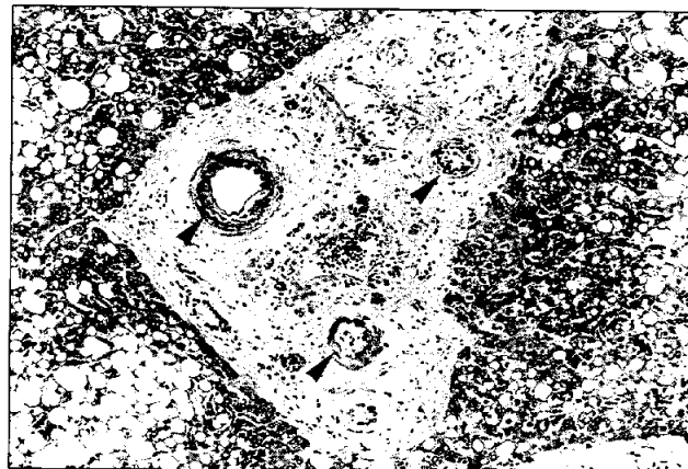
Fig 3. High-power examination of one of the portal tracts within the lesion showing hyalinized and narrowed hepatic arterioles (arrows) (H & E, x 150)