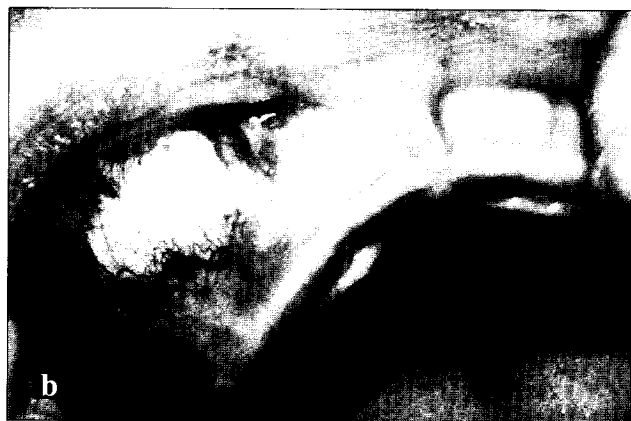
Fig 1a. The four-month-old infant presenting with enlargement of the right maxilla. Fig 1b. The intra-oral appearance of the melanotic neuroectodermal tumour of infancy.

ported. 2 The CT scan showed that the lesion extended from the midline to the right deciduous molar region, with the main mass localised in the alveolus. It produced a well-defined, dome-shaped expansion laterally and was lined by a thin layer of bone; medially, the margin was irregular. The centre was homogeneous. The teeth adjacent to the tumour were displaced laterally. One tooth germ was found inside the lesion. Some irregular radiodense areas were seen in the superior portion of the lesion. In the coronal plane, the lesion was localised to the anterior and middle portions of the maxilla (Fig 3). In the anterior maxilla, the tumour bulged downwards and laterally with no overlying cortical bone. It extended backwards with invasion of the maxillary sinus. The lateral nasal wall was thinned but intact and the orbital floor was not affected.