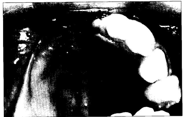
Fig 4a. Intra-oral view of the maxilla after complete healing and eruption of the primary teeth on the left side

Melanotic neuroectodermal tumour of infancy is a rare, benign neoplasm 1,3,4 that requires accurate and prompt diagnosis and radical surgical excision because of the rapid growth of the lesion in an infant. 5,6 The clinical manifestations are not unlike those of an eruption cyst or hematoma and apart from the facial enlargement may be asymptomatic for quite some time. 7,8 An incisional biopsy should confirm the diagnosis with certainty. 9,10