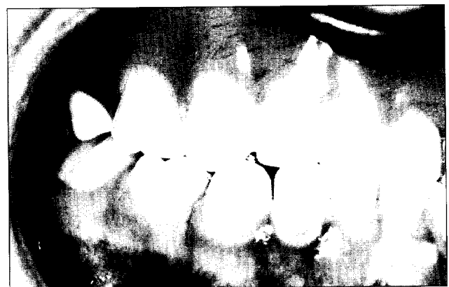
Fig 4b. The intra-oral view of the partial denture providing good aesthetics and function

The use of CT scans to more precisely locate the size, anatomical location, and lesion borders are particularly helpful to the surgeon in planning the most