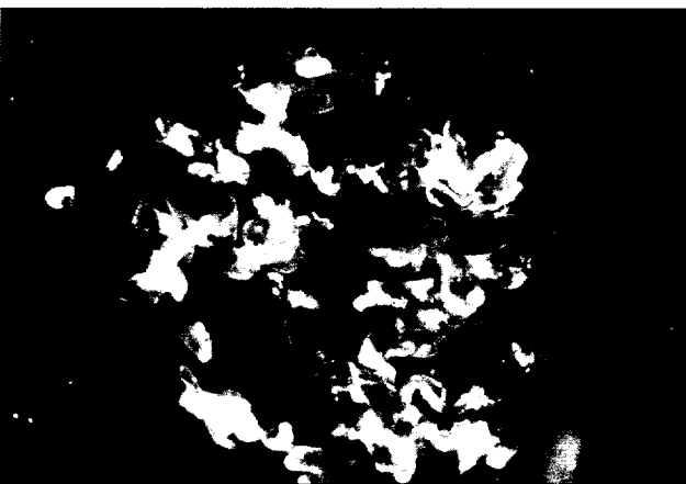
Fig 1c. Immunofluorescence staining showing IgA deposits in the mesangium of the glomerulus (x 250)