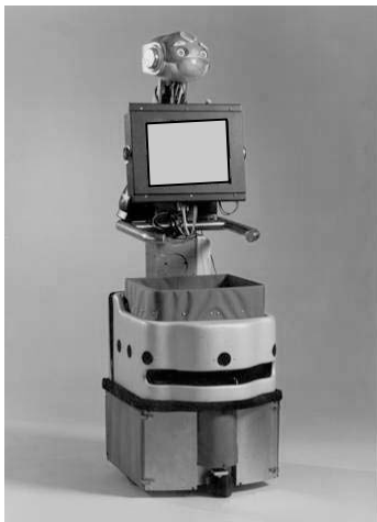
Fig. 1. Robot viewed in experiment.

In the current experiments, we asked participants to estimate the likelihood that a robot made in New York or Hong Kong would know and recognize landmarks in these cities. Half of the participants (HK condition) were told that the robot was built at a robotics institute at the Hong Kong University of Science & Technology and the other half of the participants (US condition) were told that the robot was created at a robotics institute in a university in the United States (Columbia University). Participants were shown pictures of these universities.