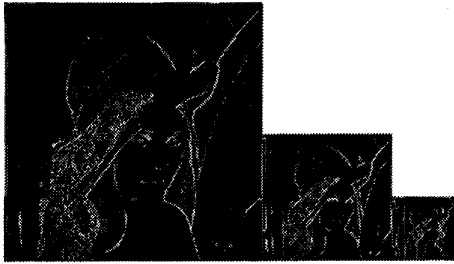
Figure 1: Laplacian Pyramid for Lena

RFs of different orientation and frequency selectivity after competitive learning. A very simple yet fast method is used to estimate the local frequency. If the intensity value sequence within the image patch is treated as a waveform, with D.C. component drawn across it, and if we count the significant zero-crossings on both the x- and y- axes, the estimated frequency f can be calculated as follows: