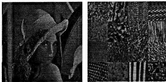
Figure 3: Grayscale images for training: 'Lena' and a composed brodatz texture image. Both are of 512 \times 512 size.

Due to the nature of the work we choose natural images with detailed frequency information for training. The standard image 'Lena' and a composed Brodatz texture image, both shown in Fig.3, are used in our experiment. Original images are of 512 \times 512 size, and 2 cycles of reducing-expanding processes generate an image pyramid of 3 images, each of size 512 \times 512 , 256 \times 256 and 128 \times 128 respectively. The receptive fields are of 4 frequency levels, and on each level there are 12 competitive fields aimed for orientation selectivity, randomly initialized at beginning. Image patch of fixed 32 \times 32 size are randomly sampled from the image pyramid and fed into the frequency selection