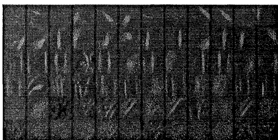
Figure 4: Receptive fields learned from multi-resolution

unit. After the frequency level is decided, receptive units on that level will learn from the input image patch through competition. The neighbourhood width begins at 4, and shrinks gradually to 0 during learning. The initial learning rate is \gamma = 0.0015 . Fig.4 shows the intensity of RF patterns after training, where RFs on the same frequency level are lined up in a row. After convergence, the increasing average selectivity of winning units, defined as y_{max} / \sum_i y_i , is found to be saturated, as shown in Fig.5.