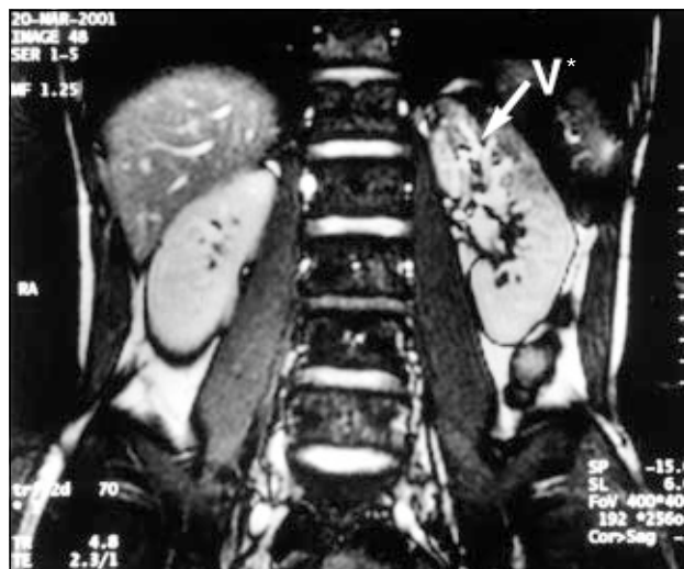
* V vasculature

The nutcracker phenomenon was first described by de Schepper 1 in 1972. Compression of the left renal vein between the superior mesenteric artery and the aorta causes left renal vein hypertension, 1 and this led to a left varicocele in this patient. The resulting renal vein hypertension is also a cause of haematuria, thought to be due to hypertension-induced anomalous calyceal-venous communications. 2 The pathophysiology of this condition is not fully understood, but it may be more prevalent in thin people with a decreased amount of perirenal and pararenal adipose tissue or in those with a prominent lumbar lordotic curve that causes forward displacement of the aorta. 3 Abnormal branching of the superior mesenteric artery from the aorta has also been attributed to be the underlying pathology. 4,5 Apart from MRI or computed tomography, selective left renal vein phlebography and renal vein pressure measurement are helpful for establishing the diagnosis. 4,5 For asymptomatic patients