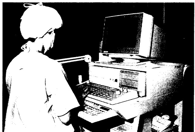
Fig 2. The machine used for intra-operative spinal chord monitoring at the Duchess of Kent Children's Hospital

In two patients with scoliosis, there were marked reductions or even disappearance of the wave forms after the corrective force was applied during surgery; the force was released immediately. In both cases, the evoked potentials recovered gradually after 15 minutes. A subsequent corrective force was re-applied cautiously and slowly with the potentials being carefully monitored. Neither patient woke up with a neurological deficit. A typical example is shown in Fig 4. We did not encounter any false negatives.