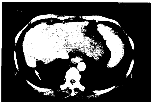
Fig 1. Post-lipoidal computed tomography scan of liver shows a nodule measuring 3 x 2 cm with intense enhancement at Segment VII (arrow)

was not used. The graft was implanted using the piggy-back technique and the cold ischaemic time was 7 hours 45 minutes. Histopathological examination confirmed the presence of a moderately differentiated HCC of TNM stage II. A triple-drug regimen of induction and maintenance immunosuppressive therapy, consisting of steroid, cyclosporine A, and azathioprine was used. She recovered quickly and was discharged from hospital on day 14 after the operation. Adjuvant systemic chemotherapy was not used. At 11 months after OLT, she was well with a normal serum \alpha -fetoprotein level and liver biochemistry (Fig 2). Computed tomography of the abdomen has not revealed any evidence of recurrence.